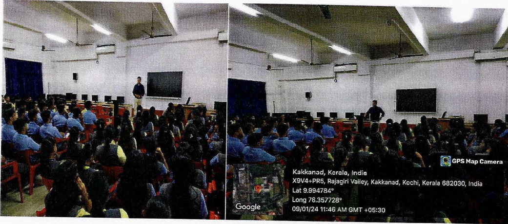
Photograph of Seminar: Navigating the Patent Filing Process