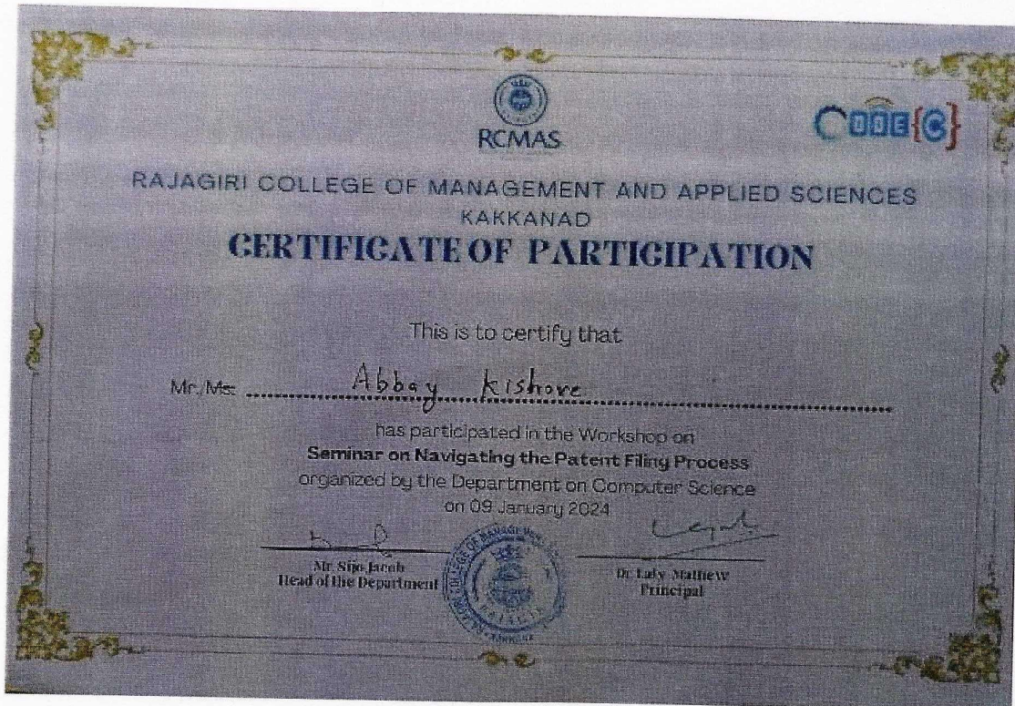
Sample Certificate for Seminar : Navigating the Patent Filing Process