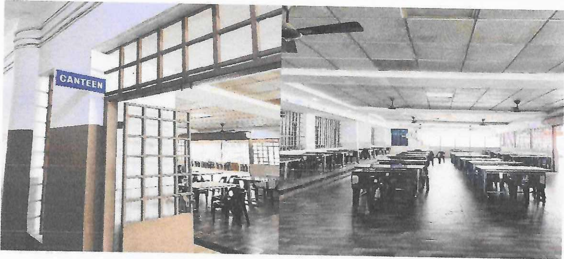
Staff Dining Area