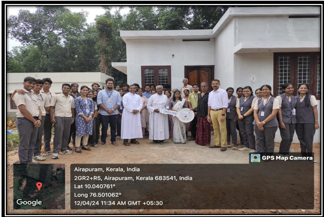
Sample Photo of key handing over ceremony of the constructed House