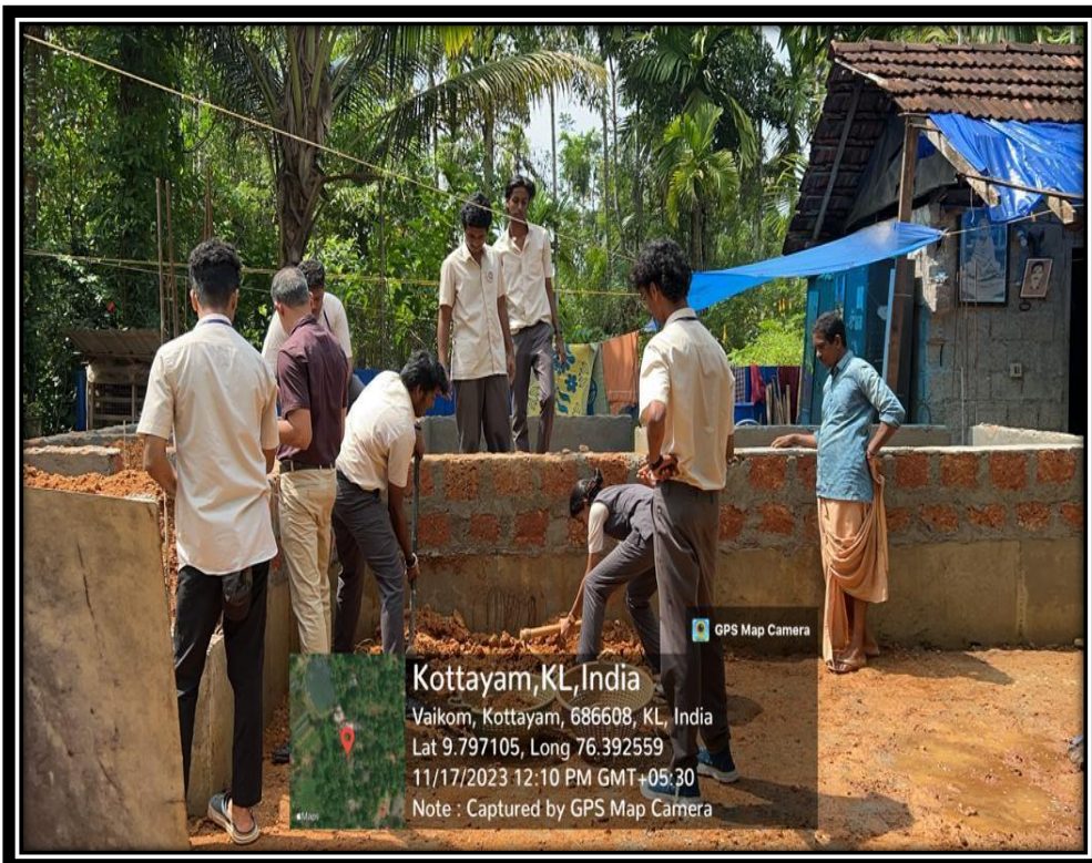
Sample Photos of House Construction