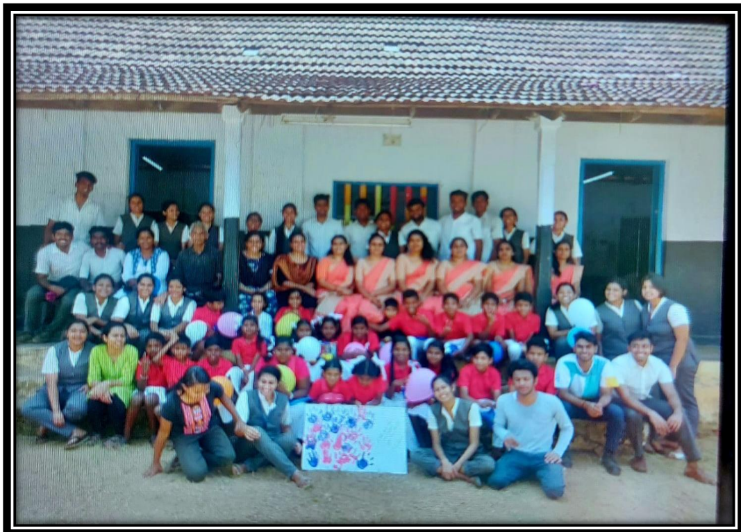
Sample Photo of Environmental Stewardship: Adoption and Beautification of Devi Vilasam School under Thanal by the Department of Management