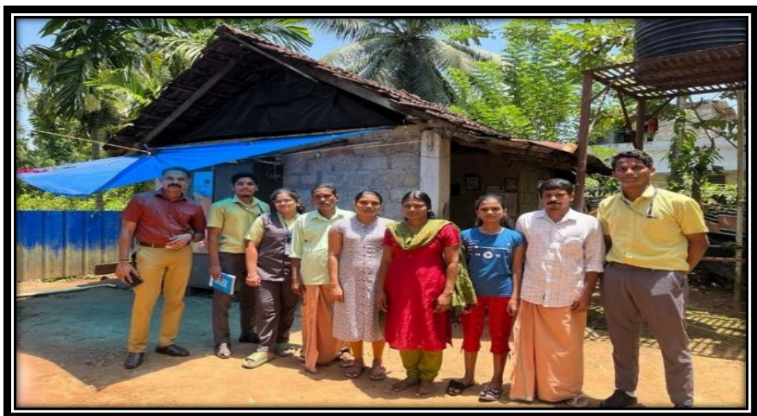
Sample Photo of Identification Visit for Snehakoodu