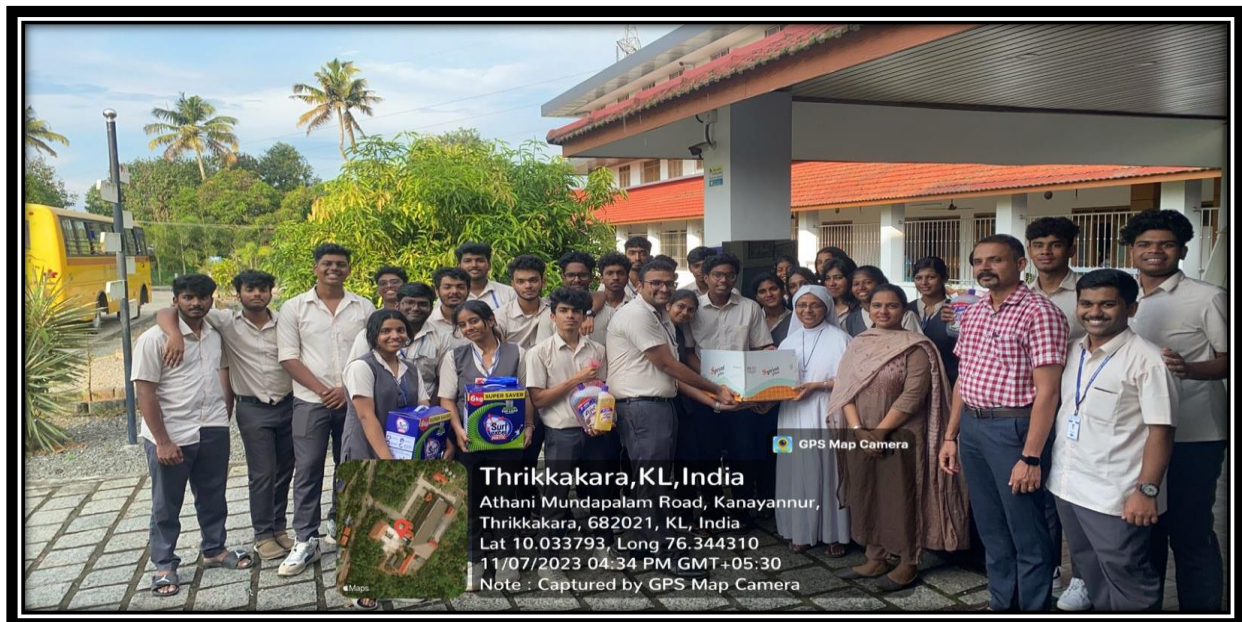
Sample Photo of Santhwanam Project: Compassionate Visit to Karunalayam under Vidyadeep by the Department of Commerce