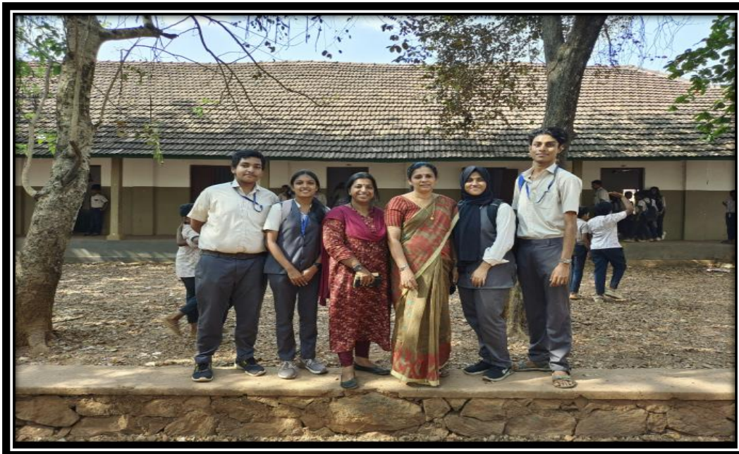
Sample Photos of Language Skills Enhancement: 'English for Daily Life' Session at St Mary's Higher Secondary School, Thalacode under Hastah by the Department of English