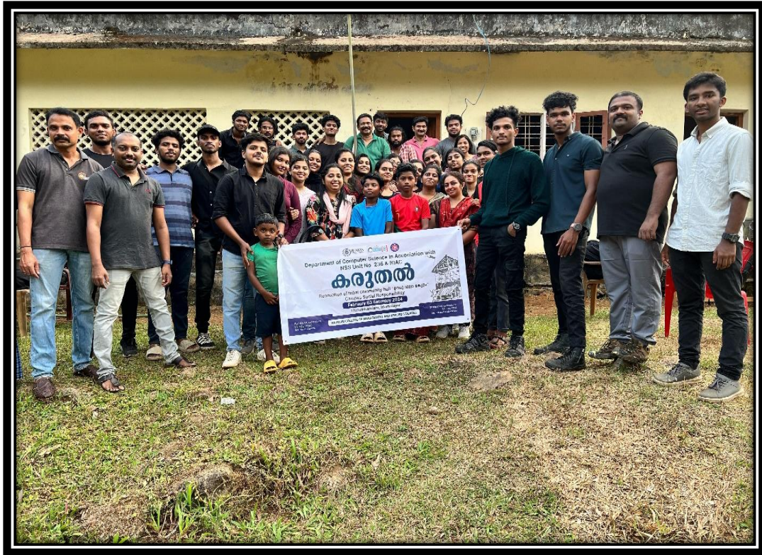
Sample Photo of Community Restoration: Karuthal Phase 1 Initiative in Thallumkandam under Karuthal by the Department of Computer Science