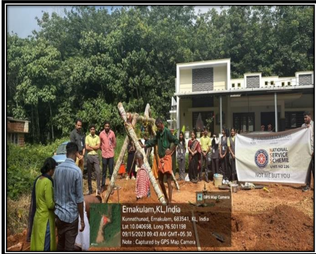
Sample Photos of Stone Laying Ceremony