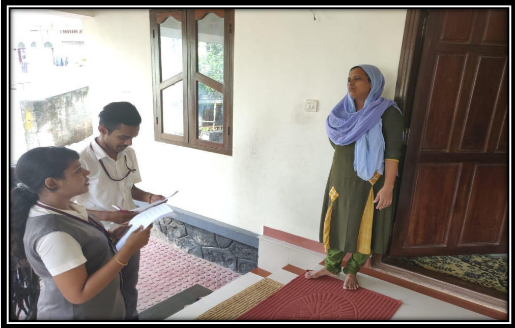
Raised awareness about plastic use, encouraging eco-friendly practices and reducing plastic waste in the community