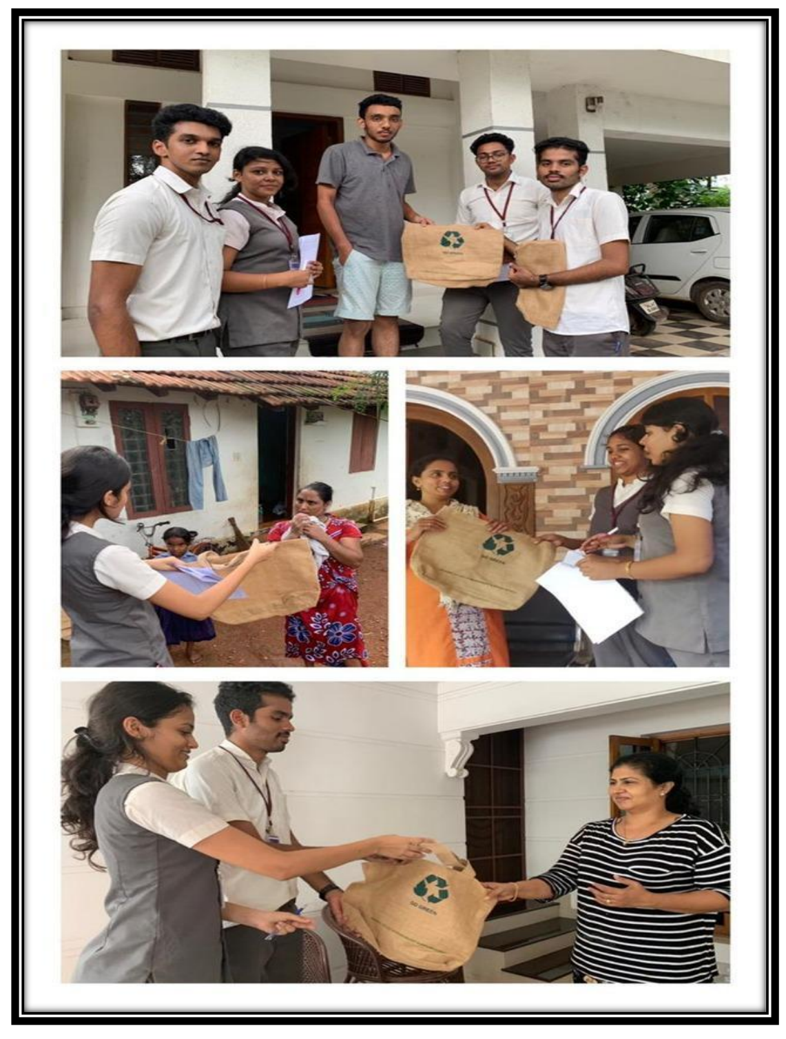
Promoted sustainable living by encouraging the use of jute bags, reducing reliance on plastic bags