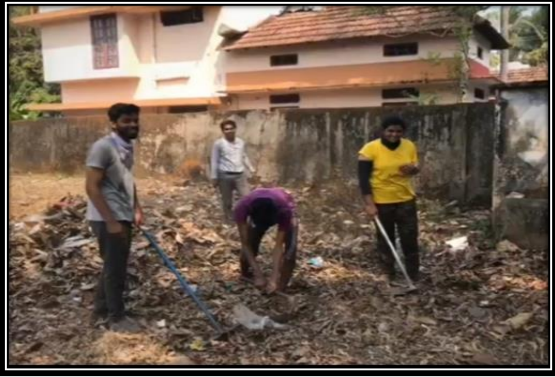
Devi Vilasam School, Nayarambalam