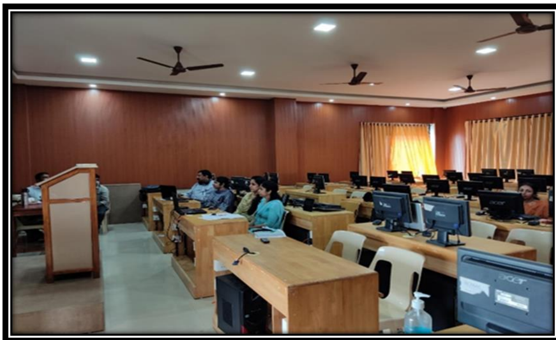
Photo of Two - Day Workshop on Unlocking Entrepreneurship Potential