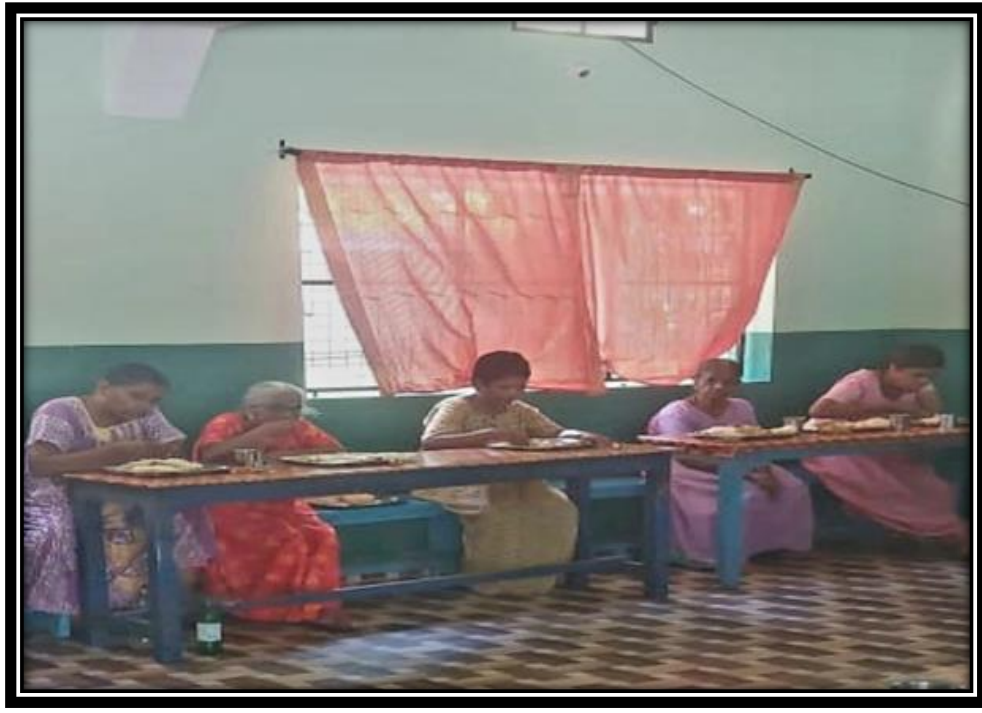
Photograph of Support for the Elderly: Donation to Deivadhan Old Age Home