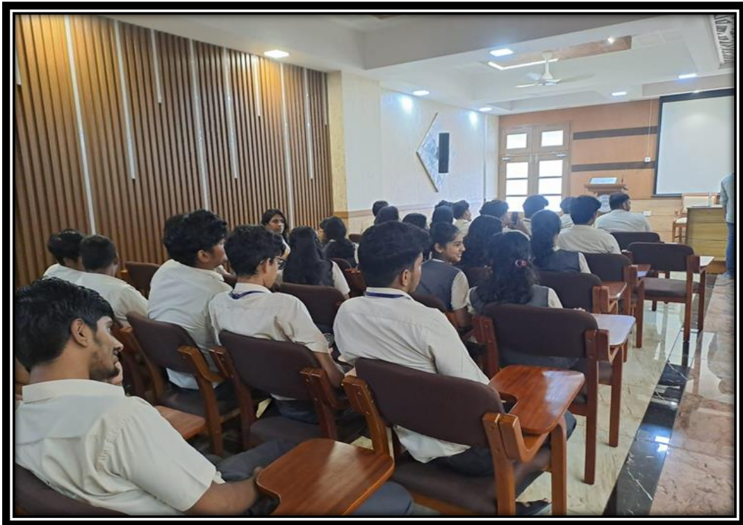
Photo of Seminar on Cloud Computing with AWS