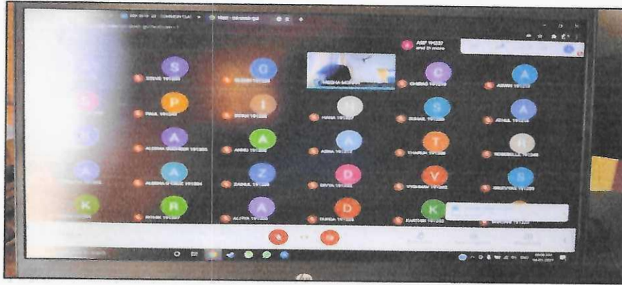
Screenshot of Seminar on Constructing a Conceptual Research Framework