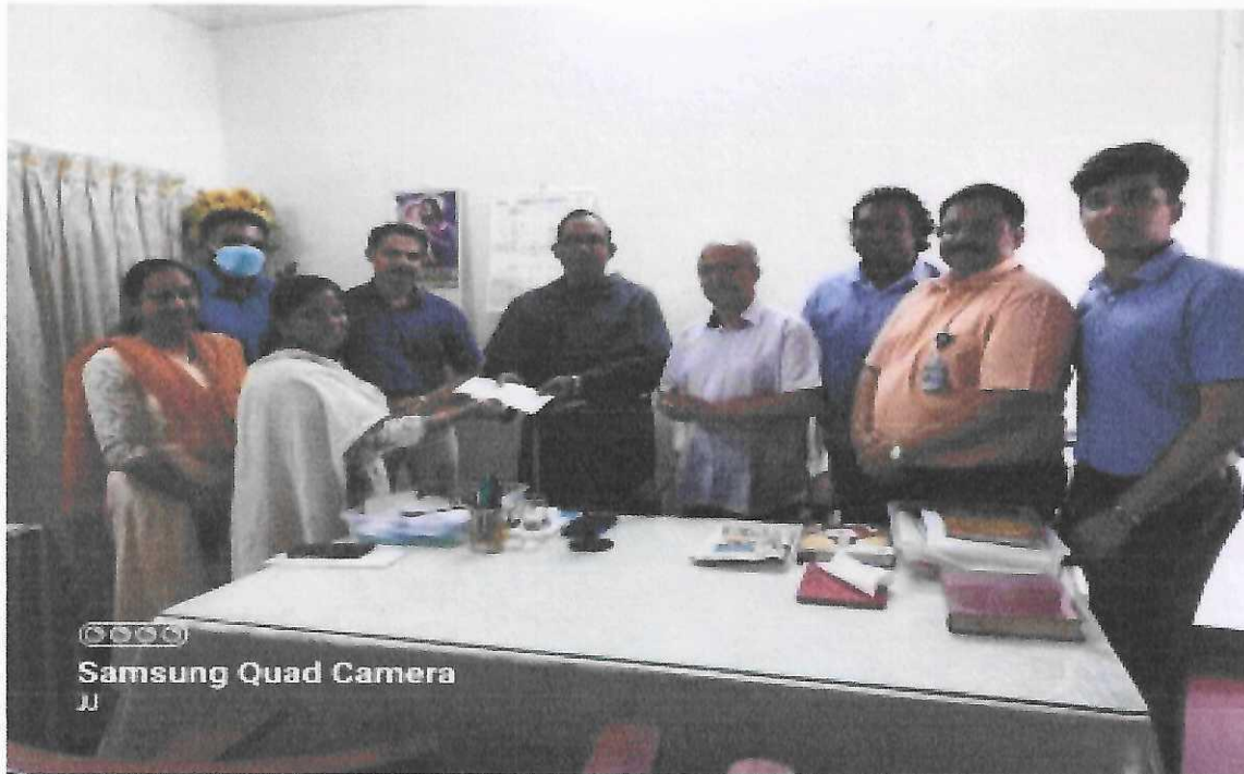
Photograph of Health Campaign: AIDS Awareness Contribution to Assisi Snehalaya