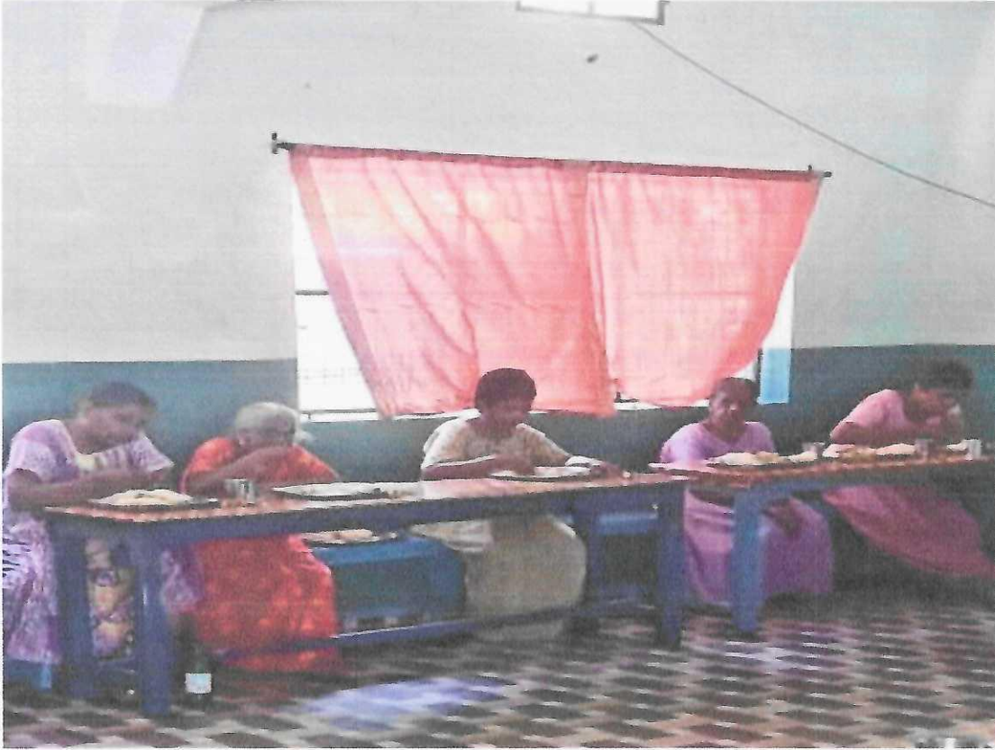
Photograph of Refreshing Relief: Onasadhya Meal Provision at Capernaum Trust