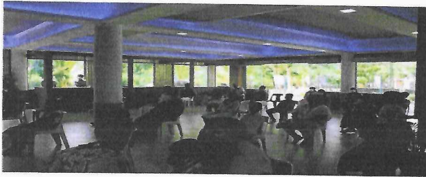
Photograph of Communication Access: Mobile Phone Donation for School Students