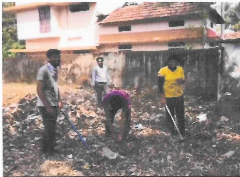
Photograph of Environmental Stewardship: Cleaning and Greening the Devi Vilasam School Premises