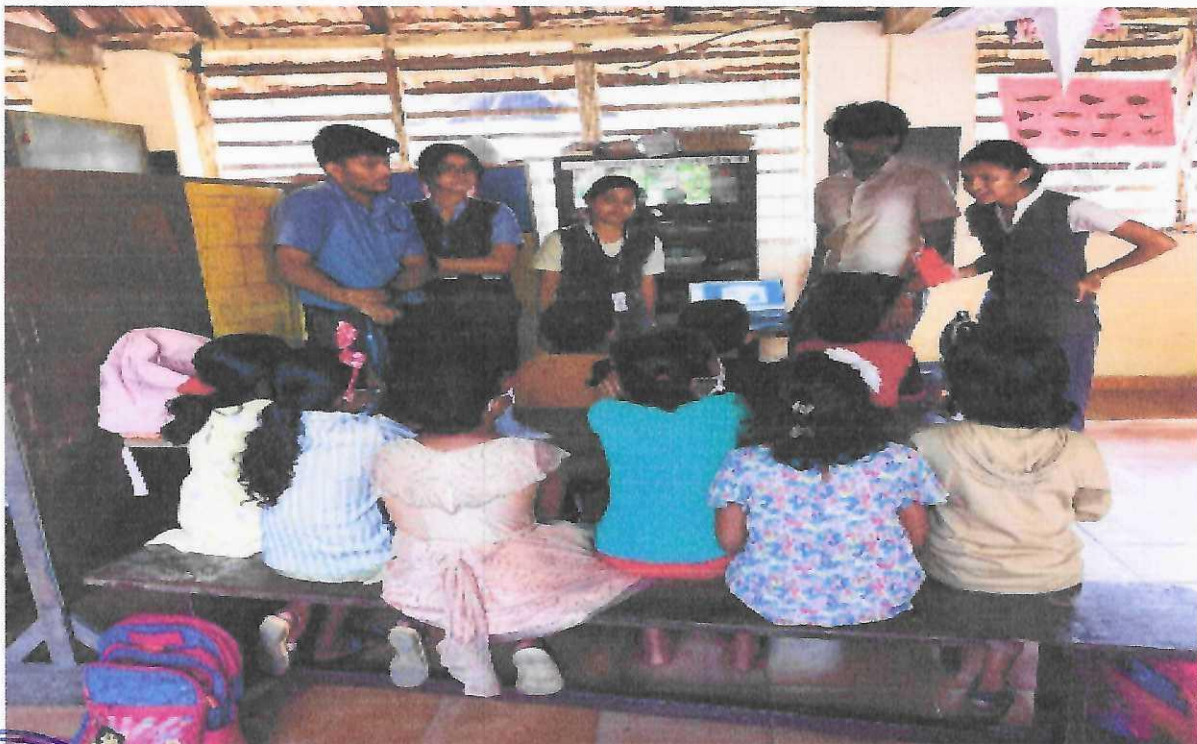
Photographs of Language Skills Development: Spoken English Training Program for Primary Students