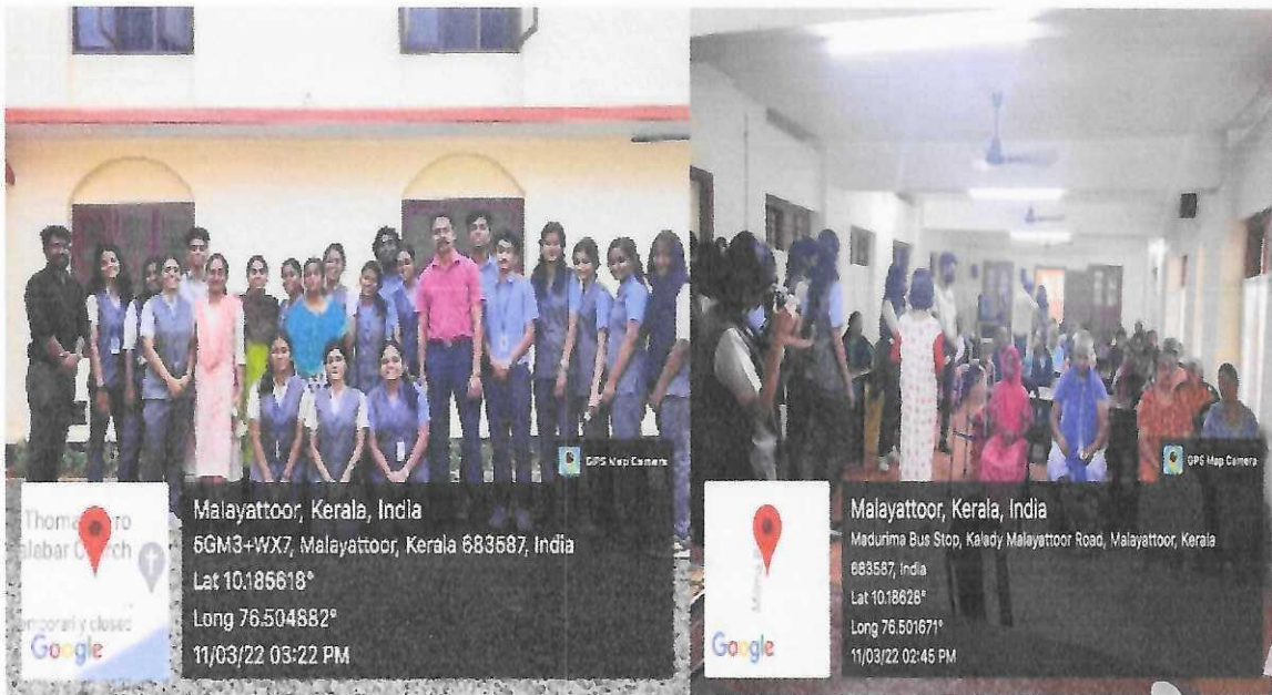
Photographs of Support for the Elderly: Donation to Deivadhan Old Age Home