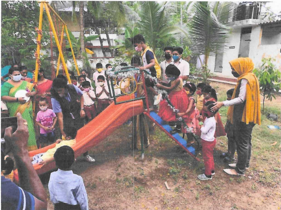
Photograph of Playground Development: Equipment for Children's Park at St. Ignatious Layola LPS